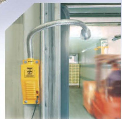
Twice the Light Output