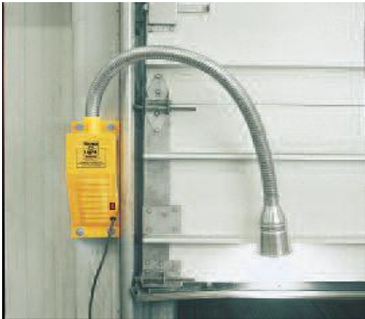
Versa Lights ® unique flexible tube design withstands sudden impact, and easily adjusts to any position.