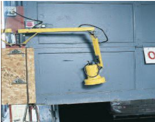
Old technology truck lights are prone to damage from overhead doors and fork lifts.

NEW! Versa Light ® XL Superior Extended Bulb Life 75% Longer